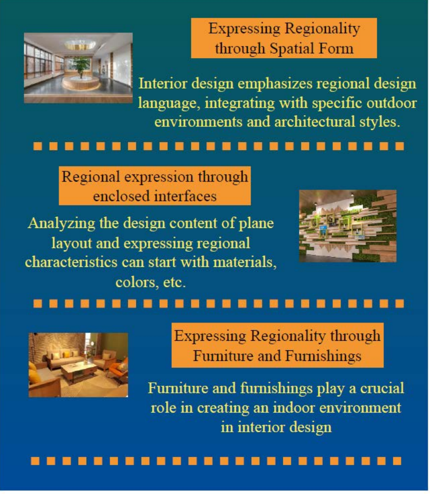
Fig.2 Interior Space Image Design

① to express regionality through spatial forms.